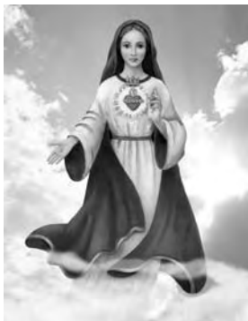
The Image of Mary, Refuge of Holy Love

The combined Revelations of MARY, REFUGE OF HOLY LOVE and the CHAMBERS OF THE UNITED HEARTS . In 1993, Our Lady asked that this Mission be known as Holy Love Ministries .