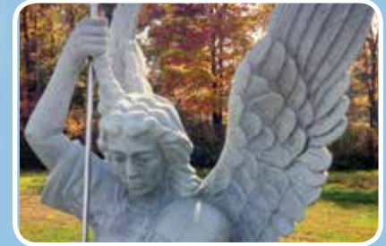
ST. MICHAEL SHRINE AND LAKE