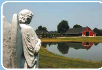
LAKE OF THE HOLY ANGELS

WEBSITE: WWW.HOLYLOVE.ORG ESPANOL: WWW.AMORSANTO.COM