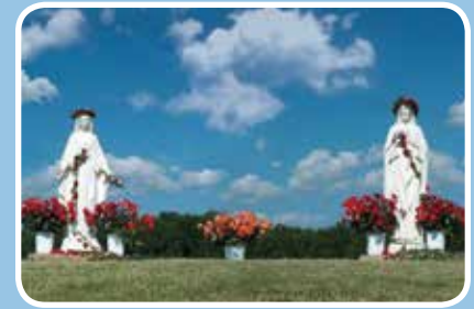
UNITED HEARTS SHRINE