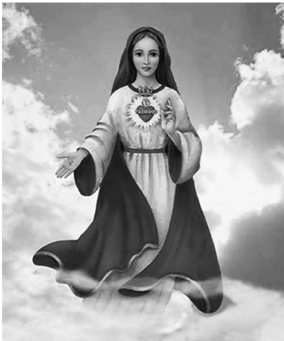
Mary, Refuge of Holy Love