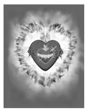
The Complete Image of the United Hearts of the Holy Trinity and Immaculate Mary