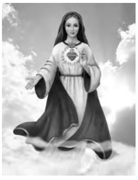
The Image of Mary, Refuge of Holy Love

The combined revelations of MARY, REFUGE OF HOLY LOVE and the CHAMBERS OF THE UNITED HEARTS. In 1993, Our Lady asked that this Mission be known as HOLY LOVE MINISTRIES.