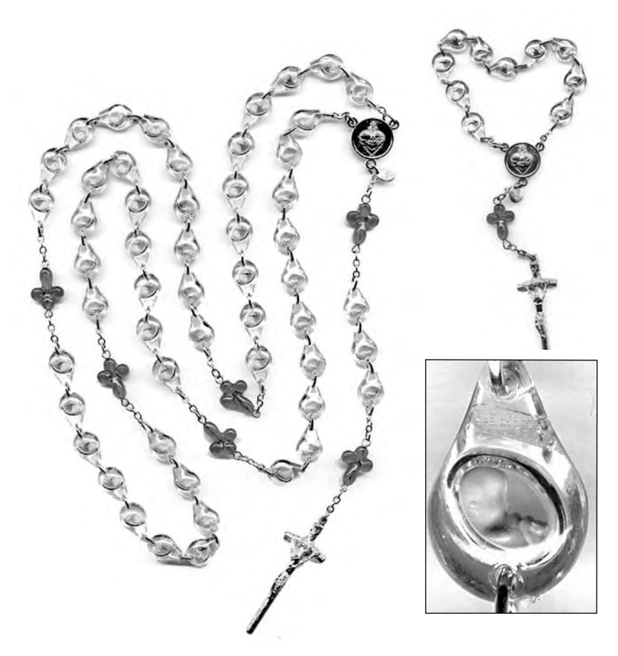
Archangel Gabriel Enterprises, Inc.

"Satan does not want you to realize the power of this Rosary when you pray from the heart. I am telling you, that the Rosary of the Unborn saves lives!"