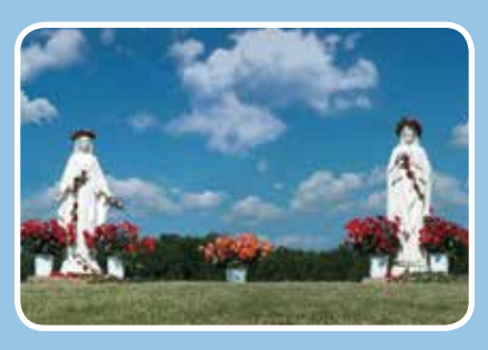
UNITED HEARTS SHRINE