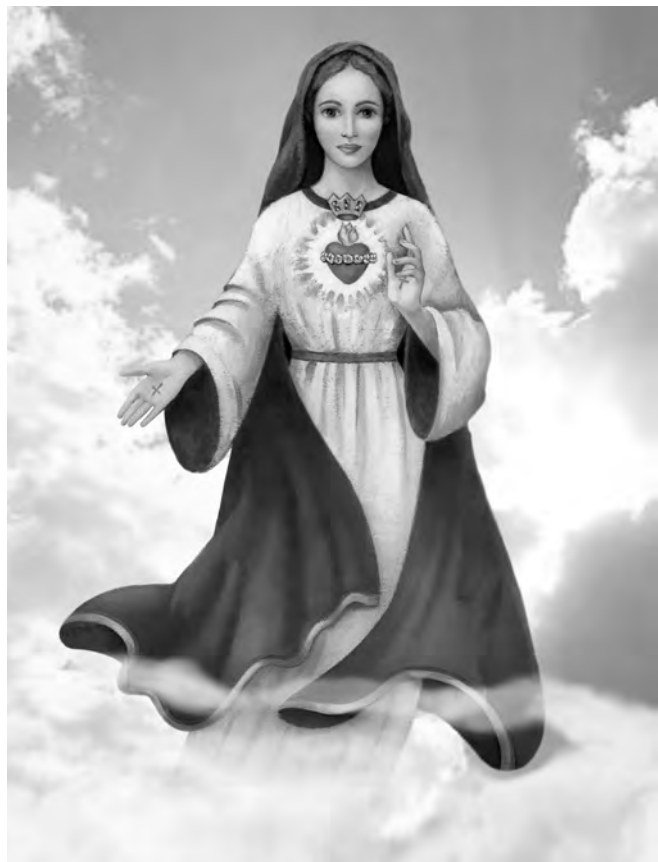
Mary, Refuge of Holy Love