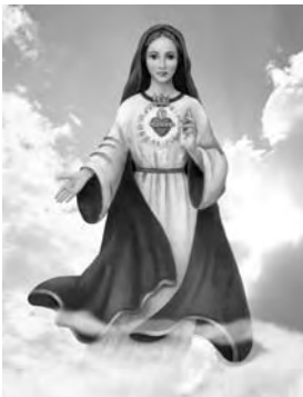
The Image of Mary, Refuge of Holy Love

The combined Revelations of MARY, REFUGE OF HOLY LOVE and the CHAMBERS OF THE UNITED HEARTS . In 1993, Our Lady asked that this Mission be known as Holy Love Ministries .