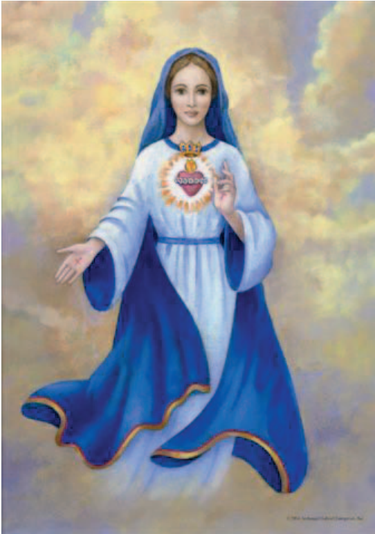
Mary, Refuge of Holy Love