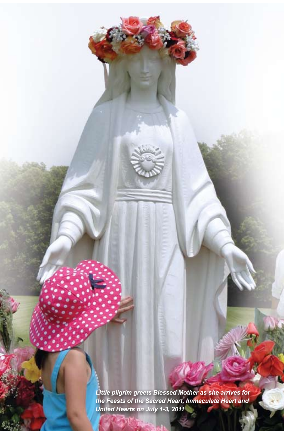
Little pilgrim greets Blessed Mother as she arrives for the Feasts of the Sacred Heart, Immaculate Heart and United Hearts on July 1-3, 2011

We welcome each of you to the newly expanded fall issue of 'MAKING IT KNOWN'. With this enlarged Holy Love publication, we strive to enhance our efforts in bringing to you the 'personal face' of the Ministry and the messages in action.