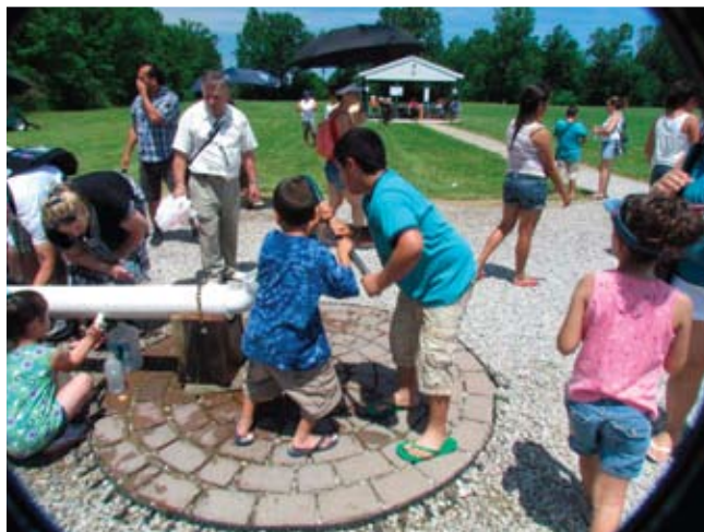
Young pilgrims help pump the Maranatha Spring water.

"Dear children, tonight I come to invite all nations to Maranatha - wellspring of grace." May 5, 1994 ■