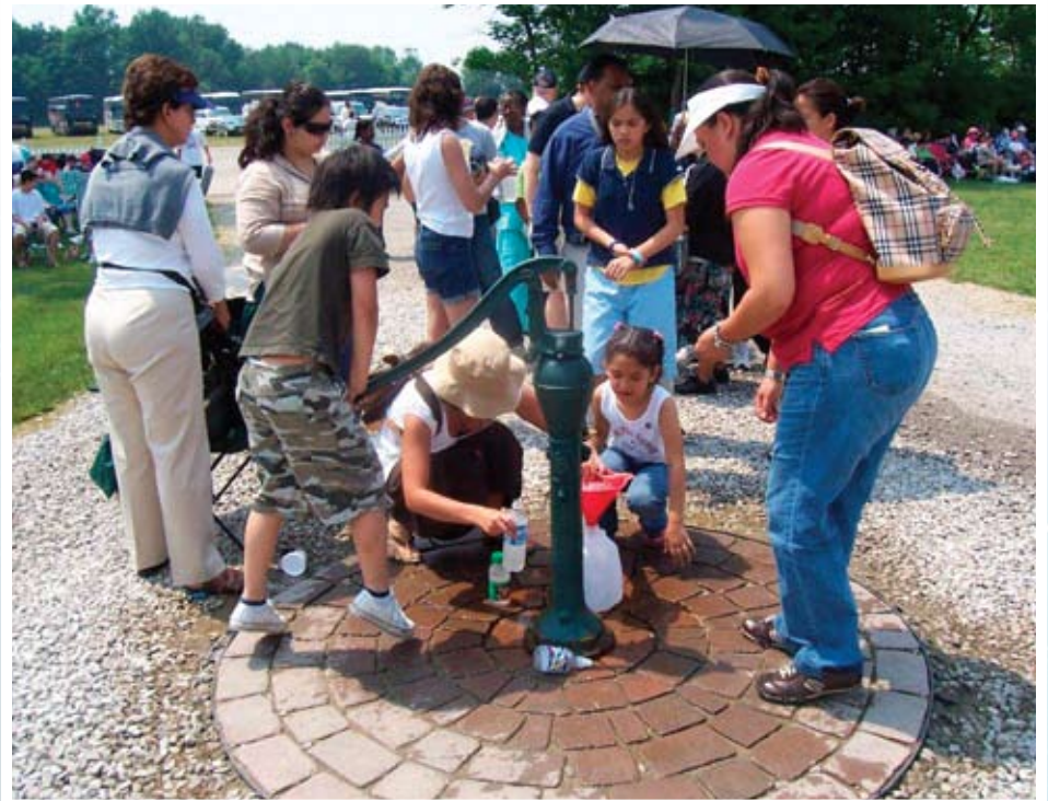
Pilgrims fill their containers at the Maranatha Spring pump.

Two and a half months went by and my father remained in a coma. There was no improvement. The doctors decided to wait about 15 more days and then remove the respirator. The doctors said there was absolutely no hope that my father would live. They said there was nothing more that they could do because his lungs were totally deteriorated. In the moment the doctors were telling me this, I