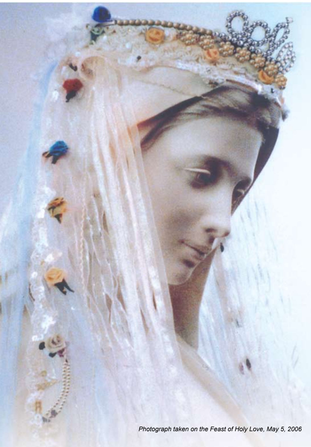
Photograph taken on the Feast of Holy Love, May 5, 2006

W e welcome each of you to the summer issue of 'Making It Known'. We thank you for the very enthusiastic reception of this new initiative to bring the Shrine and recent activities into your homes.