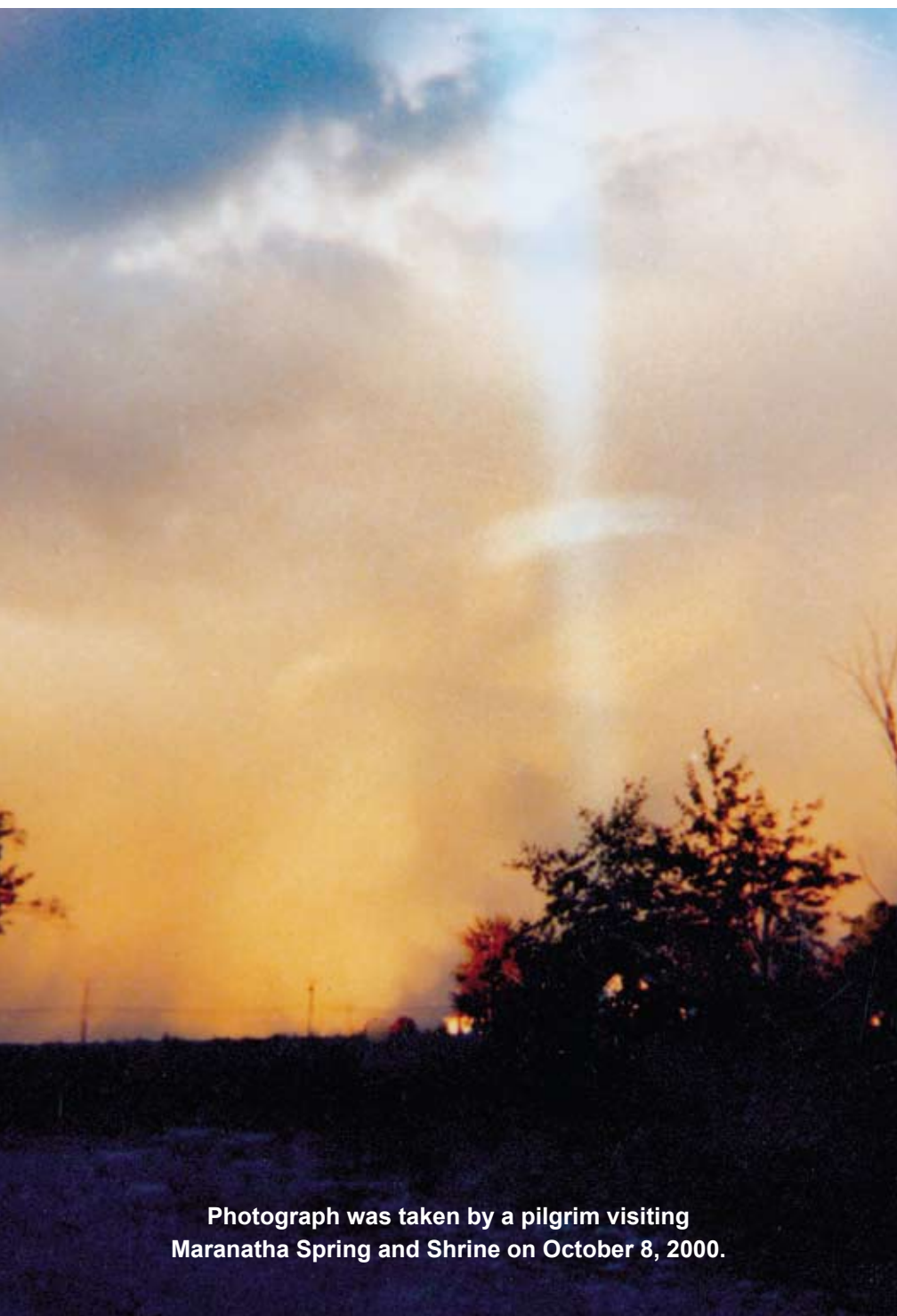
Photograph was taken by a pilgrim visiting Maranatha Spring and Shrine on October 8, 2000.

We Welcome each of you to the fall issue of 'Making it Known'. We have expanded this particular issue in an effort to share many topics and Ministry activities with you.