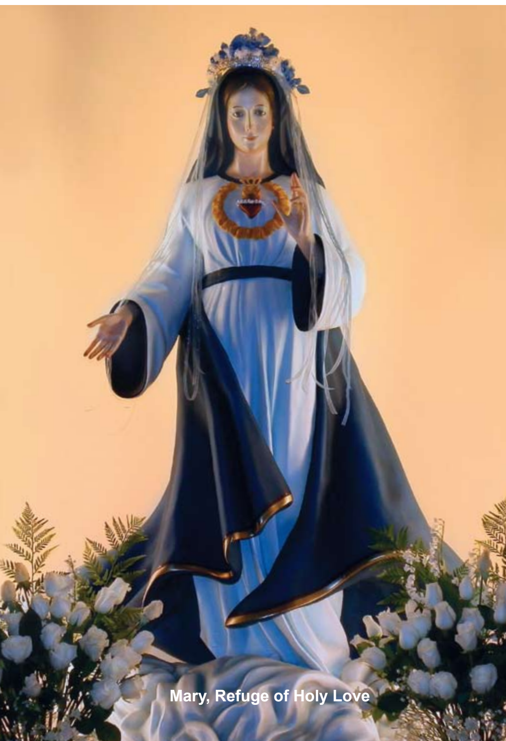
Mary, Refuge of Holy Love

We Welcome each of you to the summer issue of 'Making It Known'. We hope, as we continue to share activities and information with you, we spark an increased awareness of the Shrine, its work and the messages in action.