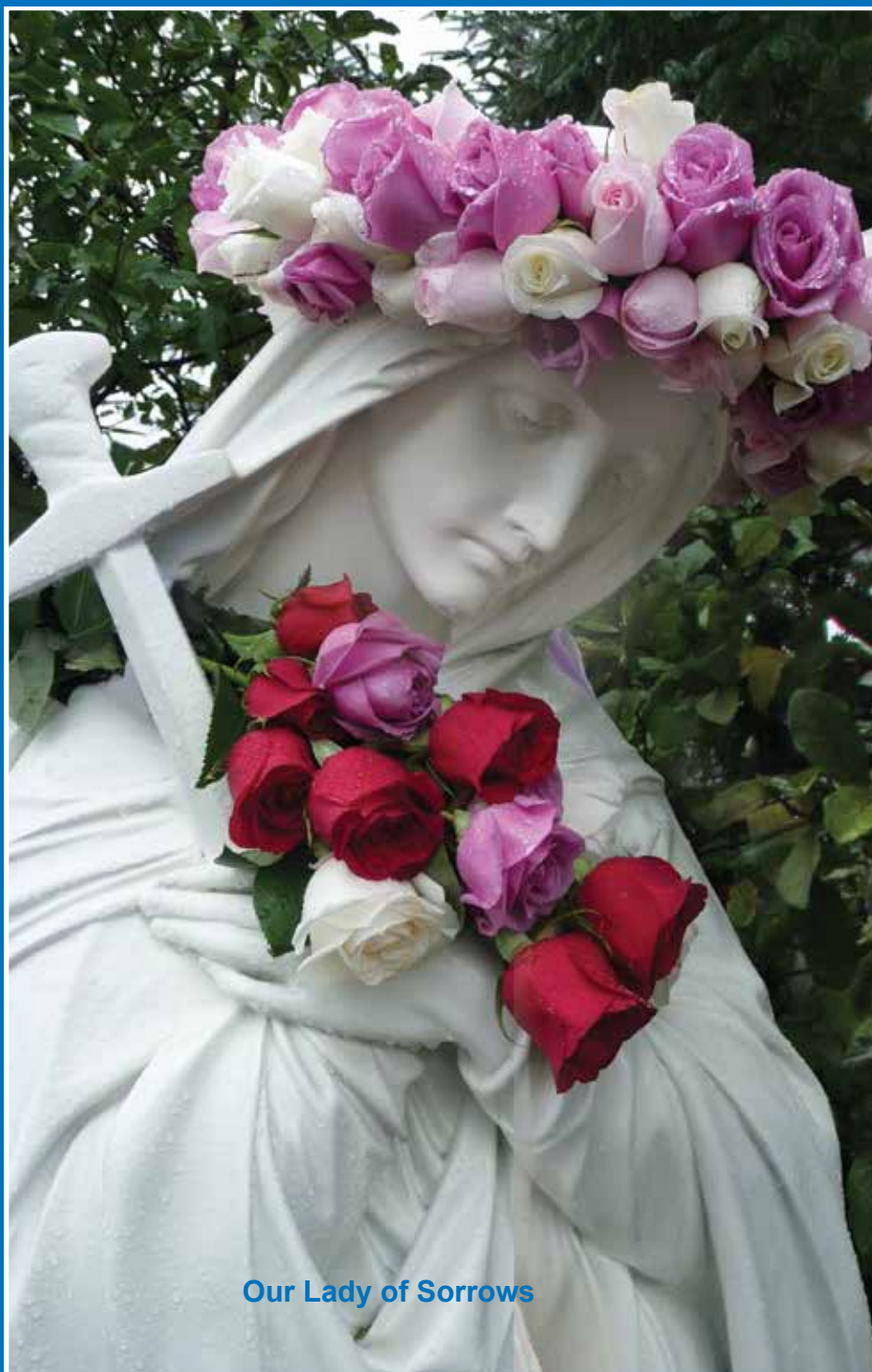
Our Lady of Sorrows

Official Publication of Holy Love Ministries, An Ecumenical Ministry