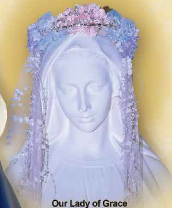
Our Lady of Grace