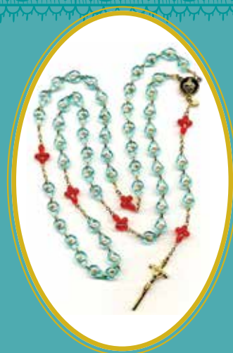
Large Rosary of The Unborn

To order, call 440-327-4532 or order online. Archangel Gabriel Enterprises Inc. Large Rosary-$24.95, Chaplet of the Unborn-$12.95 plus S&H