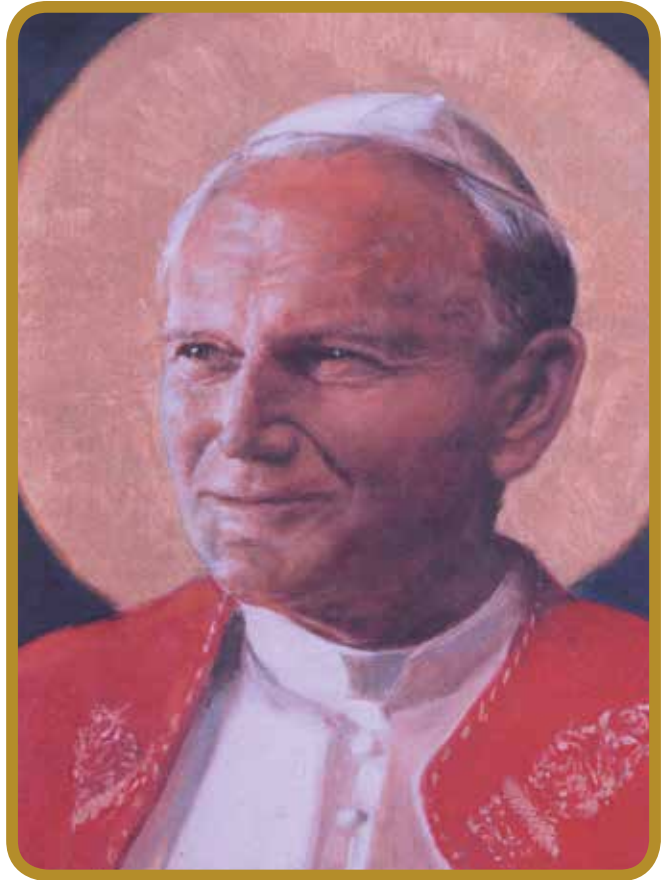
Pope Saint John Paul II

WE WELCOME ALL PEOPLE OF ALL FAITHS. PRAYER IS A UNIVERSAL LANGUAGE. All who come in pilgrimage here are invited to join us in prayer and the peace that Heaven offers at this site.