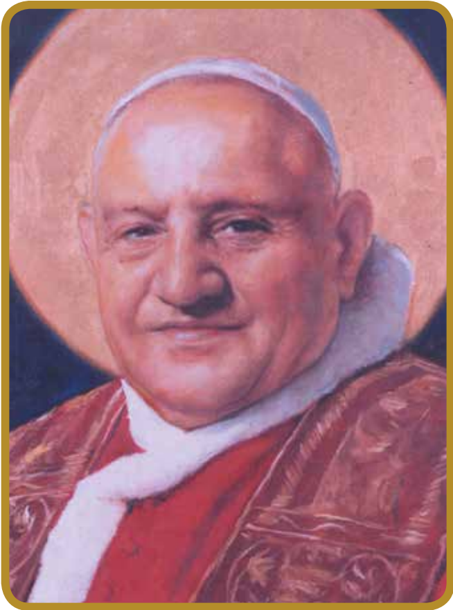
Pope Saint John XXIII

“Let us look forward now to the next apparition on the Feast of Our United Hearts [June 29 th ].” ■