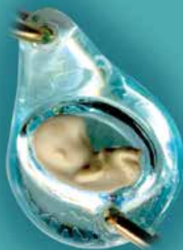
magnified view of bead