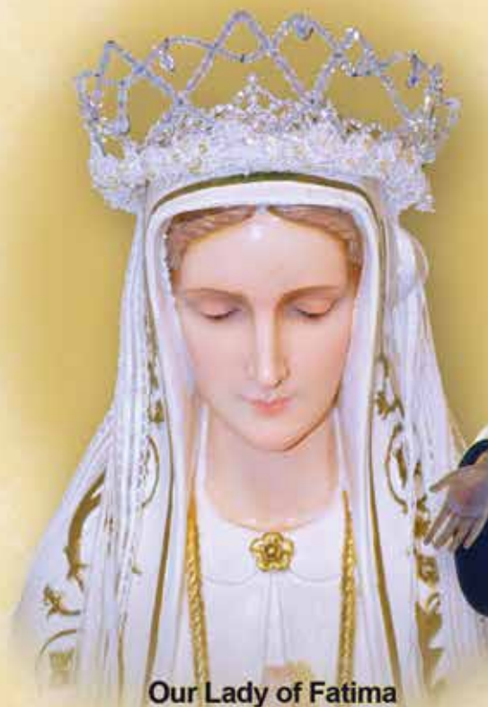
Our Lady of Fatima