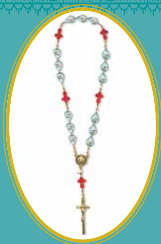
Chaplet of The Unborn