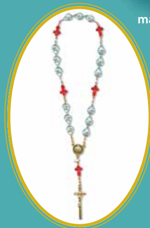
Chaplet of The Unborn