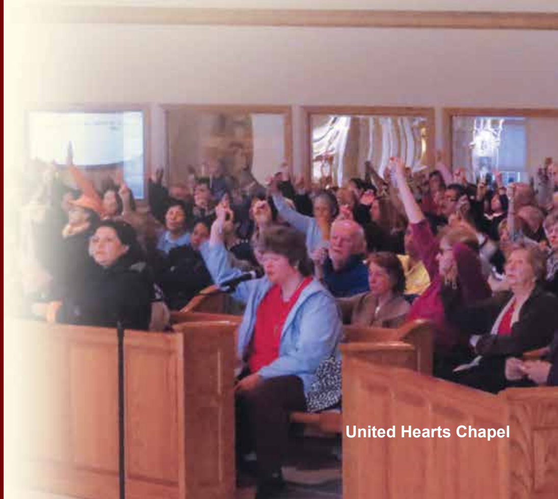
United Hearts Chapel

"I am counting on the prayers of this Mission to be an arsenal against all of this." ■