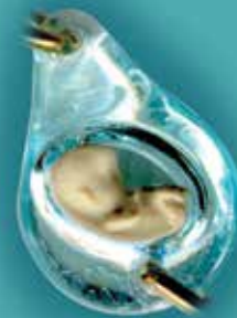
magnified view of bead