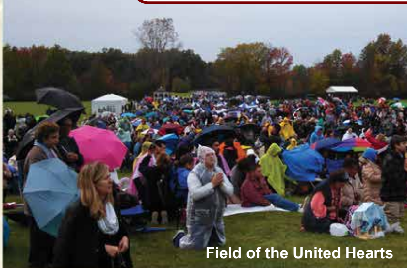
Field of the United Hearts

Finally, be strong in the Lord and in the strength of His might. Put on the whole armor of God, that you may be able to stand against the wiles of the devil. For we are not contending against flesh and blood, but against the principalities, against the powers, against the world rulers of this present darkness, against the spiritual hosts of wickedness in the heavenly places. Therefore take the whole armor of God, that you may be able to withstand in the evil day, and having done all, to stand. Stand therefore, having girded your loins with Truth, and having put on the breastplate of righteousness, and having shod your feet with the equipment of the gospel of peace; above all taking the shield of faith, with which you can quench all the flaming darts of the evil one. And take the helmet of salvation, and the sword of the Spirit, which is the Word of God.