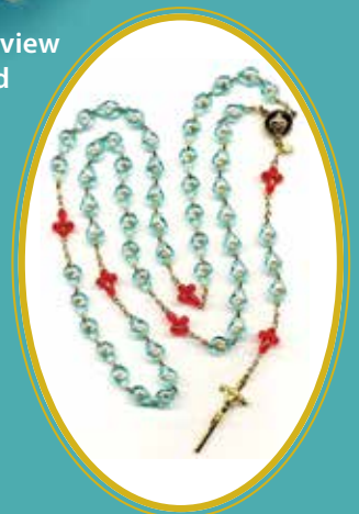
Large Rosary of The Unborn

To order, call 440-327-4532 or order online. Archangel Gabriel Enterprises Inc. Large Rosary-$24.95, Chaplet of the Unborn-$12.95 plus S&H (prices subject to change)