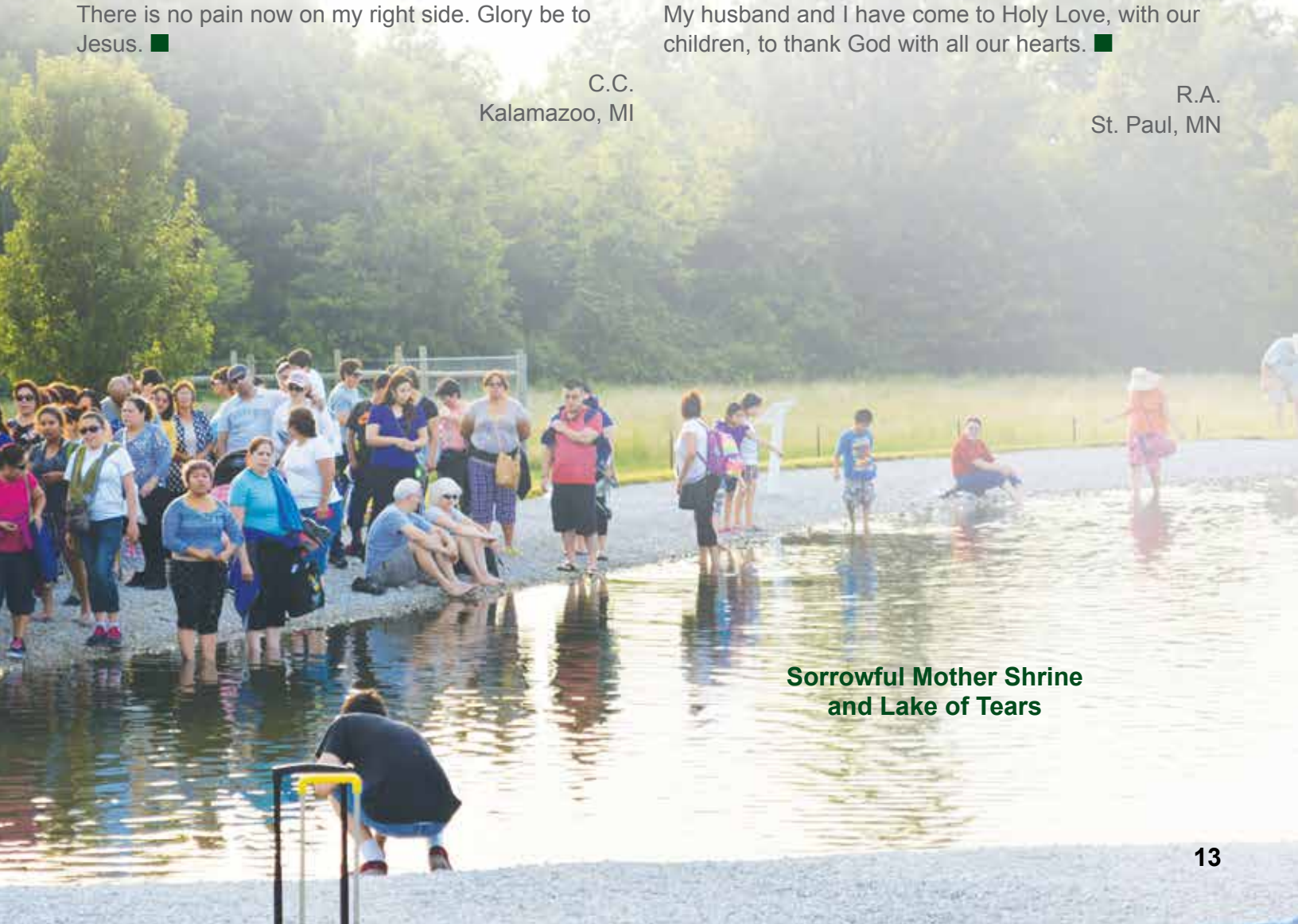
Sorrowful Mother Shrine and Lake of Tears