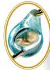
magnified view of bead