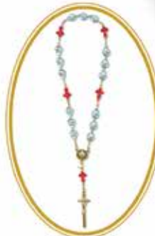
Chaplet of The Unborn