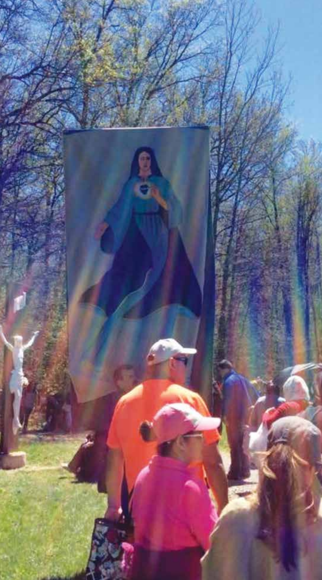
Extraordinary photo of rainbow-colored rays of light shining down upon the pilgrims entering the Stations of the Cross at the Divine Mercy Event