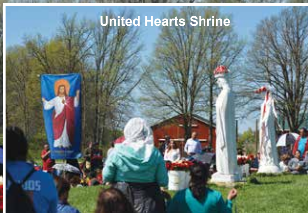
United Hearts Shrine