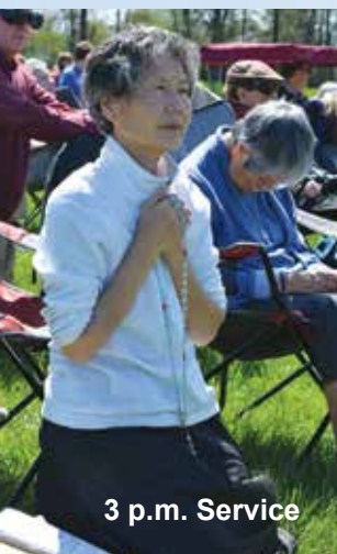
3 p.m. Service