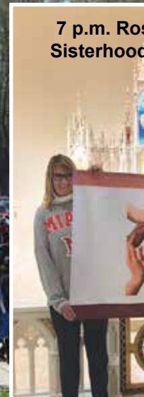
7 p.m. Rosary Sisterhood