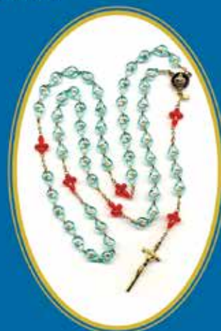
Large Rosary of The Unborn