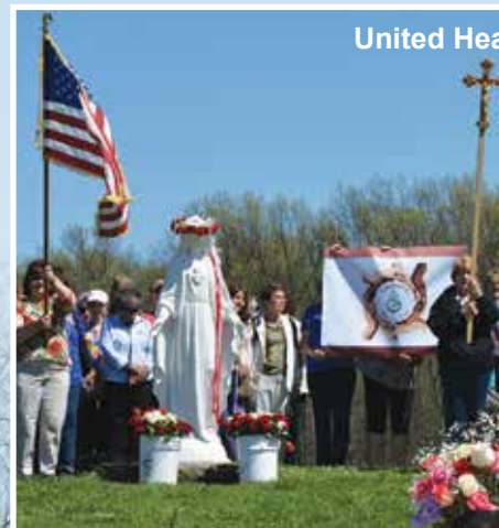
United Hearts Shrine