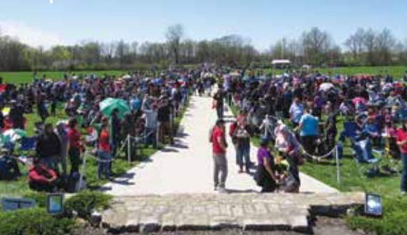
3 p.m. Service - United Hearts Field