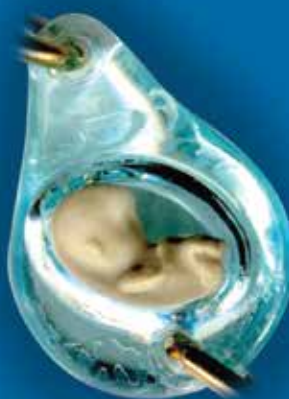
magnified view of bead