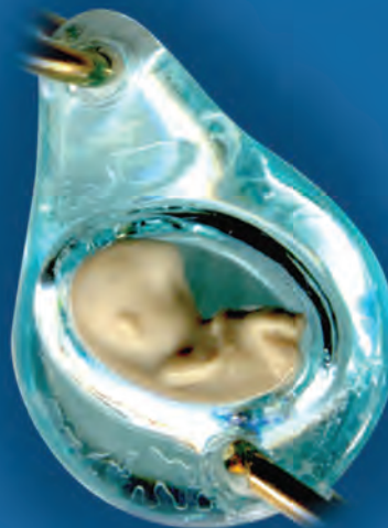
magnified view of bead