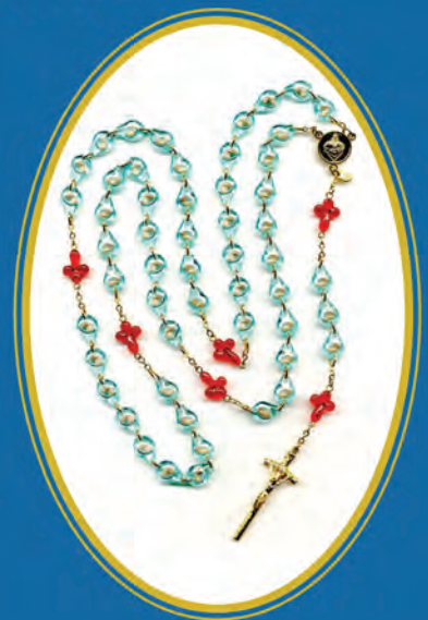
Large Rosary of The Unborn