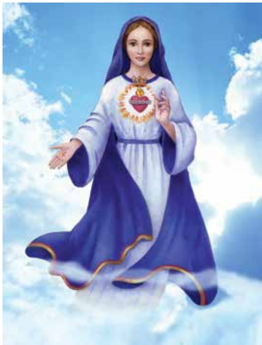
Mary, Refuge of Holy Love

ARCHANGEL GABRIEL ENTERPRISES INC. RosaryOfTheUnborn.com