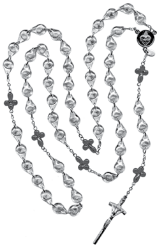
Rosary of the Unborn