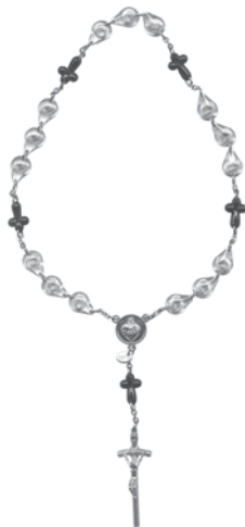
Chaplet of the Unborn