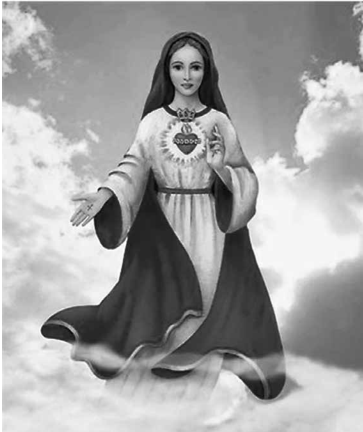
Mary, Refuge of Holy Love