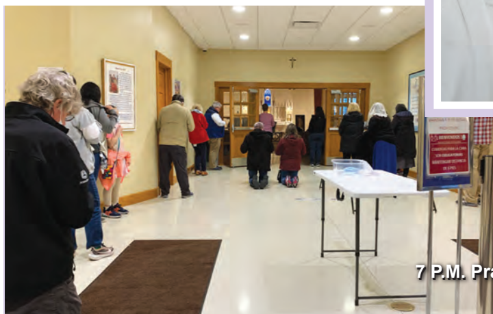
7 P.M. Prayer Service