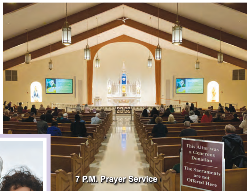
7 P.M. Prayer Service

This Altar was a Generous Donation The Sacraments are not Offered Here