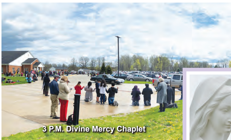
3 P.M. Divine Mercy Chaplet

♥ April 11, 2021 – Feast of Divine Mercy. At God the Father's request, pilgrims gather at the Shrine for a day of private prayer (no Apparition). At 3 P.M., pilgrims stop to pray the Divine Mercy Chaplet as it is broadcast in the Ministry Complex and parking lot. God the Father imparts His Triple Blessing at 3:10 P.M. A 7 P.M. Service is conducted in the United Hearts Chapel, broadcast in the parking lot to accommodate the crowd, and livestreamed.