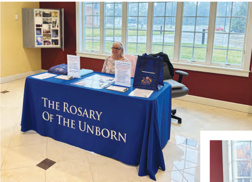
A freestanding Registration Table inside the Aquinas Welcome Center for Pilgrims visiting during the year