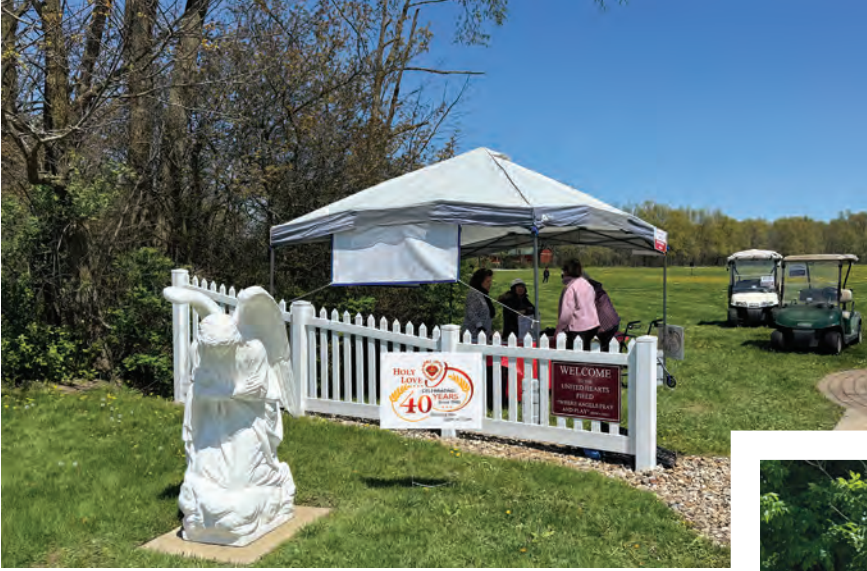
A Registration Booth inside the entrance to the United Hearts Field at the Divine Mercy Event – April 27, 2025