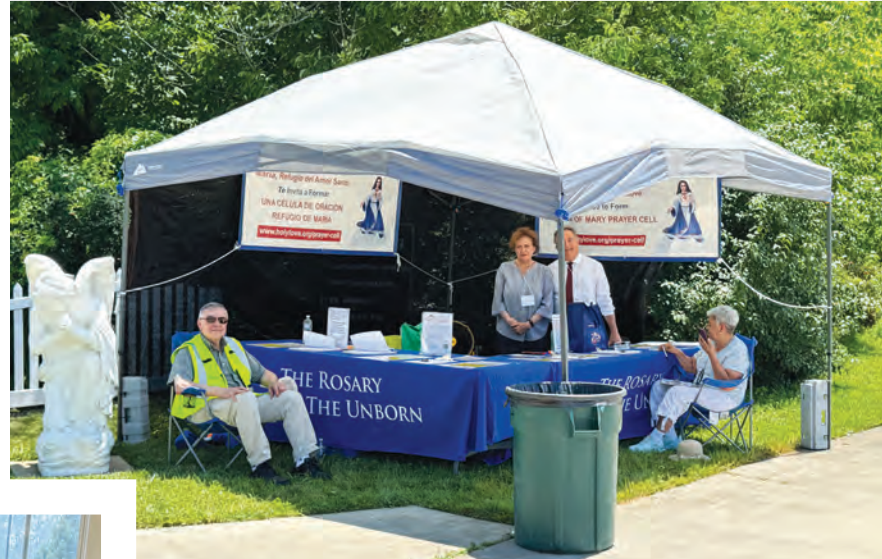
A Registration Booth at the entrance to the United Hearts Field at the United Hearts Event – June 29, 2025