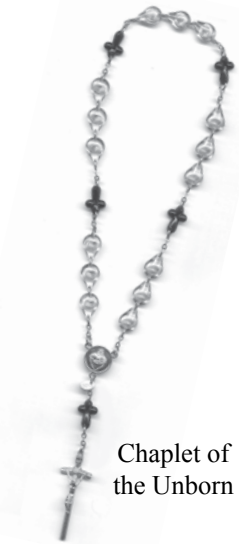
Chaplet of the Unborn