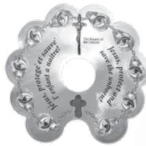
Rosary Finger Card